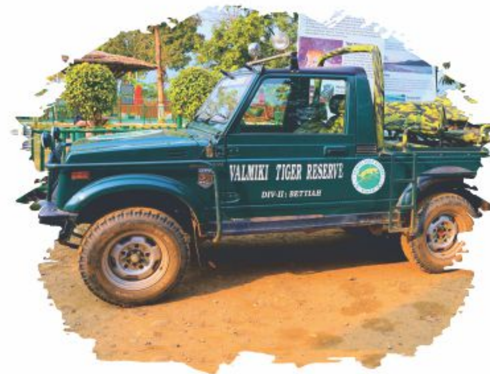
Valmiki Tiger Reserve

Valmiki Tiger Reserve is a renowned protected area situated in the West Champaran district of Bihar. It covers a vast area of approximately 901 square kilometres and is known for its rich biodiversity and stunning landscapes. The protected areas are bordered by Nepal in north while the Indian state Uttar Pradesh bounds the Wildlife Sanctuary from western side. The reserve is named after the legendary Hindu sage Valmiki, who is believed to have written the epic Ramayana. The Valmiki Nagar Tiger Reserve is home to a diverse array of flora and fauna, including Bengal tigers, leopards, sloth bears, flying fox, flying squirrels, wild cats, langur, several species of deer and antelopes, barking deer, spotted deer, hog deer, sambar, and blue bull, over 250 species of birds and a variety of reptiles and butterflies. The reserve's dense forests, rolling hills, and meandering rivers provide a picturesque backdrop for tourists and nature enthusiasts alike.