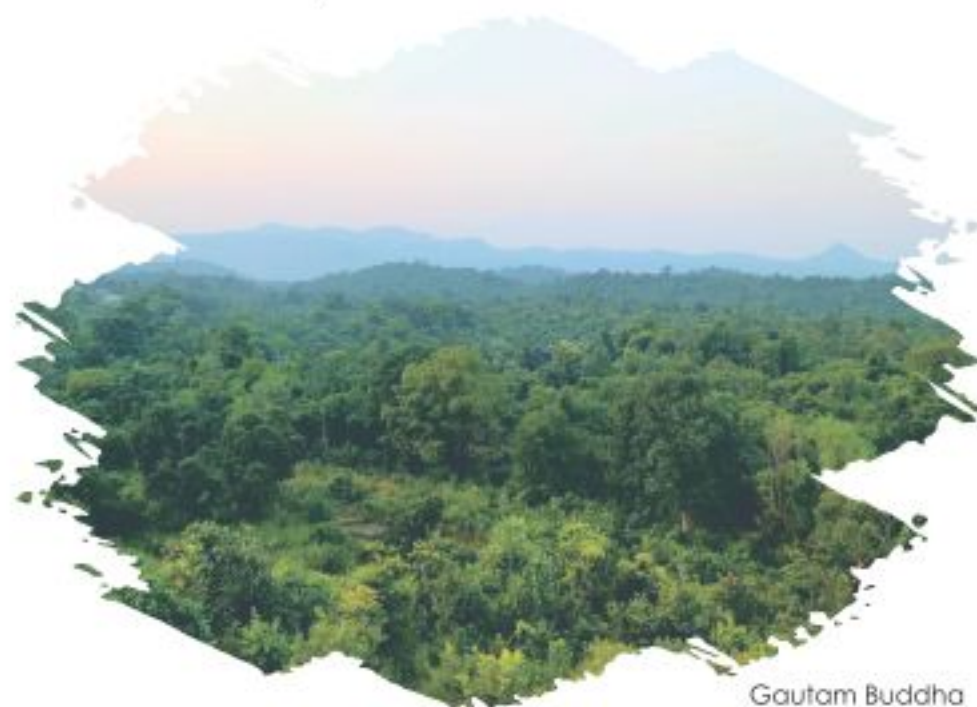
Gautam Buddha Wildlife Sanctuary

Kusheshwar asthan Bird Sanctuary, spreading over 7019.75 acres is unification of 14 waterlogged villages situated in Kusheshwar asthan block. You can spot endangered species of migratory birds from Mangolia and Siberia, as well as indigenous species like Dalmatian Pelican, Indian Danter, Bar headed goose and many more between November to March.