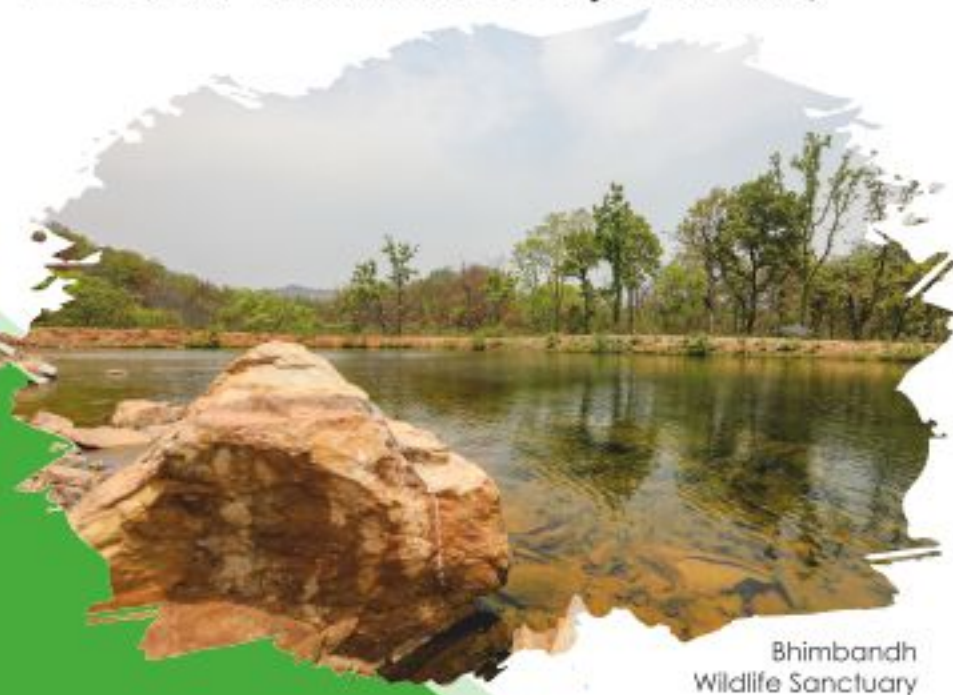
Bhimbandh Wildlife Sanctuary

Bhimbandh Wildlife Sanctuary is a protected area located in the Southwest Munger district of Bihar. Established in 1976, the sanctuary spans over an area of approximately 682 square kilometers and is known for its diverse flora and fauna including tigers, leopards, wild boars, sloth bears, chitals, sambars, and many more. This area is also famous for its hot springs, Sita Kund & Rishi Kund.