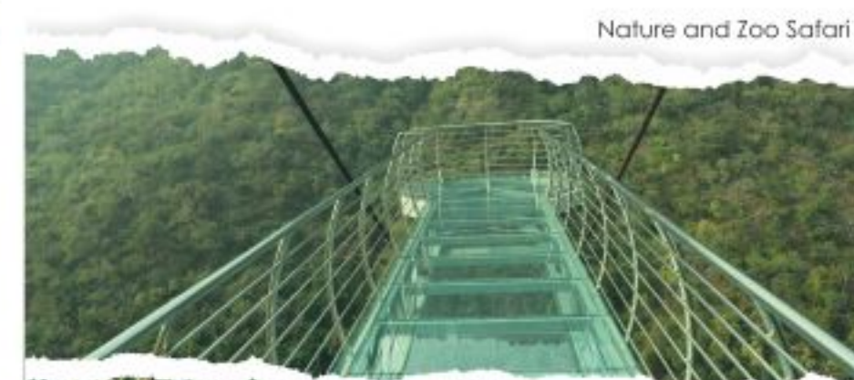
Nature and Zoo Safari

Zoo Safari has five zones namely Herbivore Safari, Bear Safari, Leopard Safari, Tiger Safari and Lion Safari which accommodate over 250 herbivores and carnivores, it is a unique destination that offers visitors an opportunity to explore the wilderness and witness the diverse flora and fauna of the region.