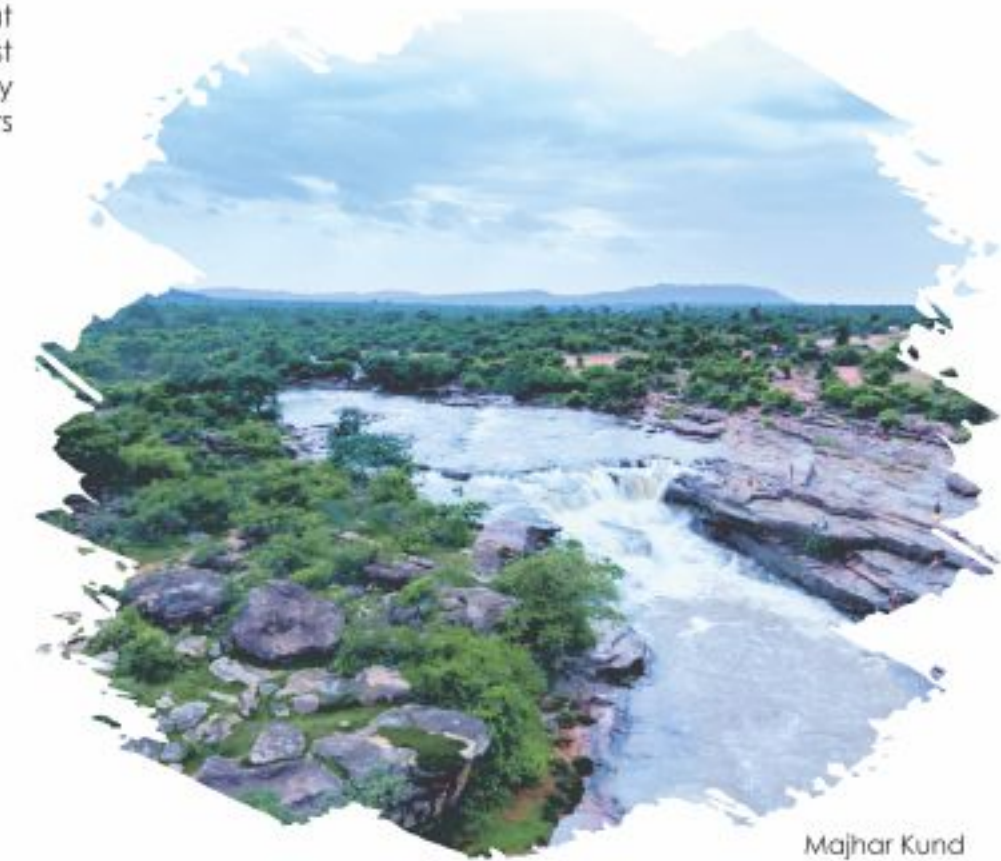
Majhar Kund & Dhuan Kund

Manjhar Kund and Dhuan Kund are two beautiful natural waterfalls located in the Rohtas district. The waterfalls are situated amidst the lush green forests of the Kaimur hills and are fed by the pristine waters of the nearby streams. It is ideal place for nature lover.