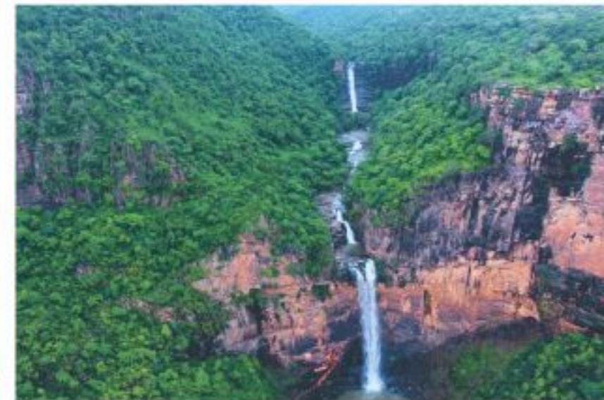
Tutla Bhawani Waterfall

Indrapuri Barrage (also known as the Sone Barrage) is across the Sone River in Rohtas district. The Sone River originates near Amarkantak Hill in Chhattisgarh and finally merges with the Ganges River near Patna in Bihar. The Indrapuri Barrage at Indrapuri is 1,407 metres (4,616 ft) long and is the fourth longest barrage in the world. This barrage is known for its scenic beauty and tranquillity and attracts a large number of tourists and visitors every year.