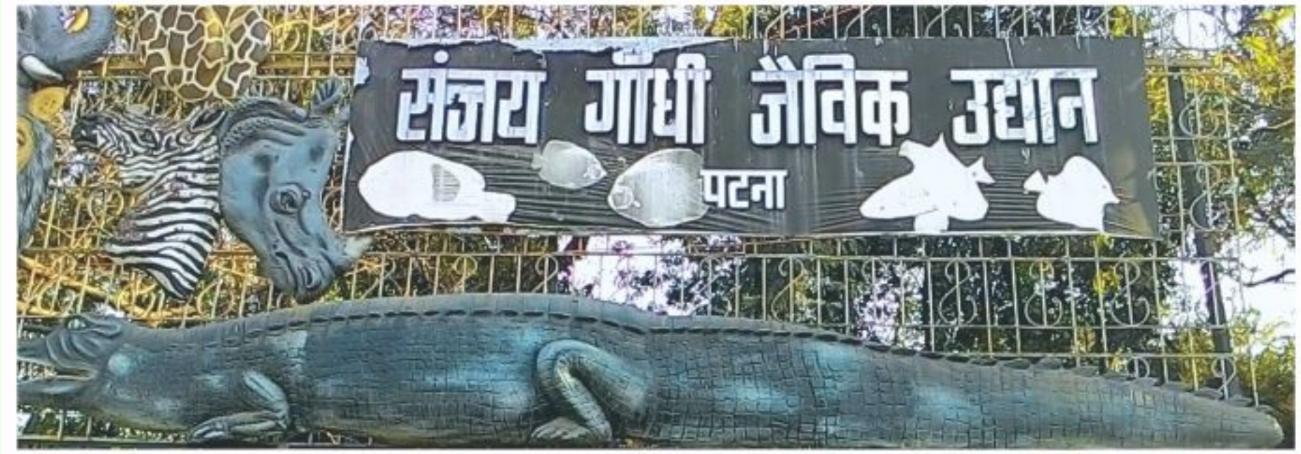
Sanjay Gandhi Biological Park

The Gautam Buddha Wildlife Sanctuary was constituted in 1976 on the line of the Project Tiger and is in the South-East part of Gaya. It is one of the best faunal and floral area of Bihar. It is rich in terms of biodiversity.