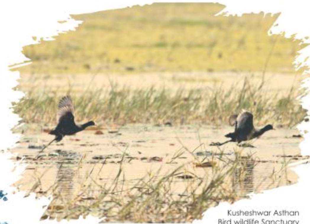
Kusheshwar Asthan Bird wildlife Sanctuary

The Kanwar Lake is located 22 km north-west of Begusarai Town in Manjhaul. It is Asia's largest freshwater oxbow lake, formed due to meandering of Burhi Gandak river, a tributary of Ganga. This is an important habitat for migratory birds.