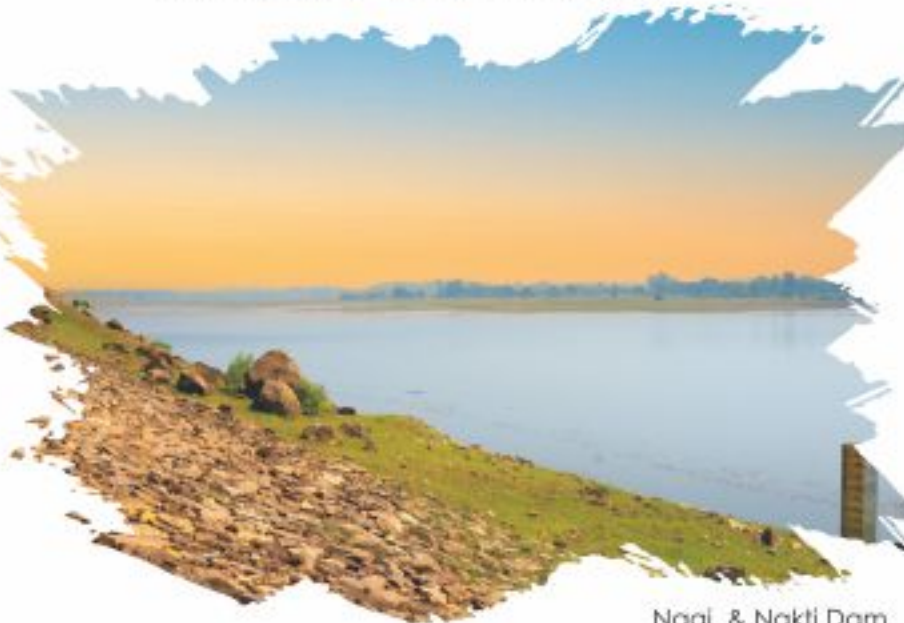
Nagi & Nakti Dam