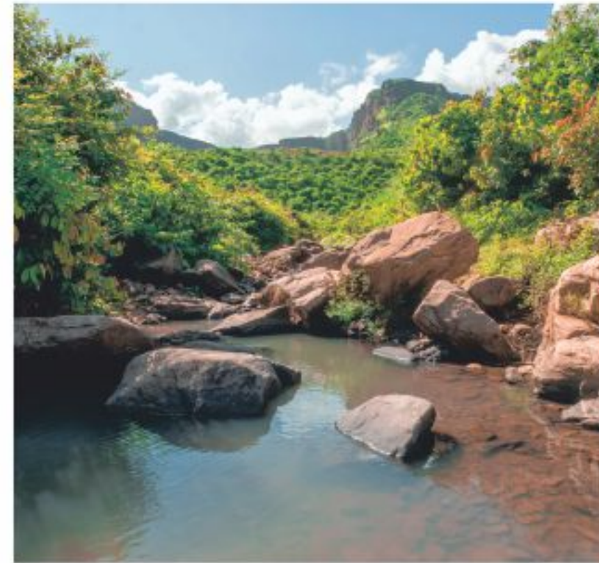
Kaimur Wildlife Sanctuary

Kaimur Wildlife Sanctuary is a stunning natural preserve located in the Kaimur. Covering an area of over 1505 square kilometers, Kaimur Wildlife Sanctuary is the largest sanctuary in the state and is home to a variety of endangered species, including Chinkara, four-horned antelope, blue-bulls, sambar, cheetal, bear and leopard. Snakes, pythons, crocodiles and many more. Kaimur Wildlife Sanctuary is a must-visit destination that offers an unforgettable experience.