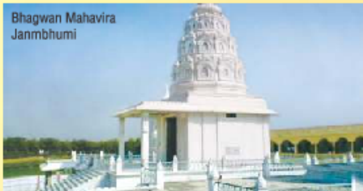
Bhagwan Mahavira Janmbhumi

This sacred site is believed to be the place of salvation of Bhagwan Mahavira. This place has a huge lake with Lotus flowers with a Jain temple right in the middle. Presently, this temple is under the Shwetambar Jains. This tirth is the place of the last monsoon sojourns of Mahavira Swami. Several kings and rich merchants had come to hear the sermons of Bhagawan Mahavira. Tourists from across the world flock in huge numbers to take blessings here.