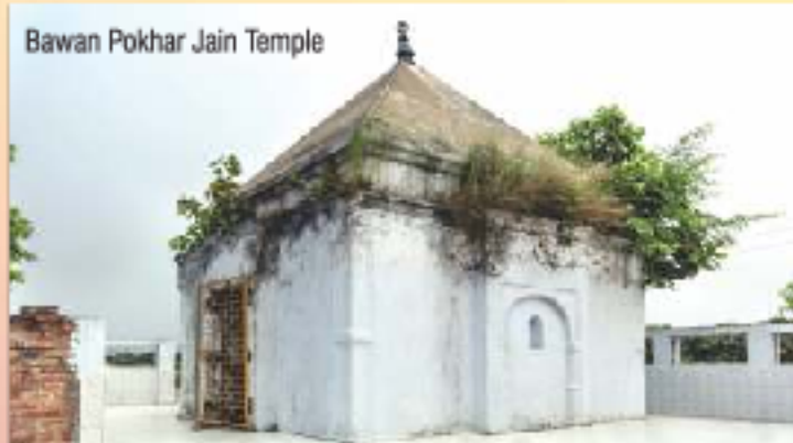
Bawan Pokhar Jain Temple

Vaishali was one of the earliest republics in the world. Vaishali is believed to be the birthplace of Bhagwan Mahavira, the twenty-fourth and last tirthankara of present cosmic age. Hence, Vaishali is revered as a pious and auspicious pilgrimage spot for Jains.