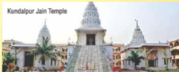
Kundalpur Jain Temple

Where To Stay: You can stay at Ajatsatru Vihar (accommodation of BSTDC). There are many moderately priced hotels where you can stay.