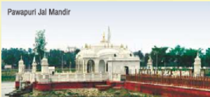
Pawapuri Jal Mandir

The term Samwasarana or Samosharana refers to the divine preaching hall of the Tirthankara. As per popular belief, the 24 th Tirthankara Bhagwan Mahavira had delivered his first and last sermon to his disciples here. As a mark of respect and to pay tribute to the holy event, the Svetambara Jains had built a temple here. There is a magnificent white marble conical shaped shrine with a large flight of steps standing erect in the middle of the white marble yard.