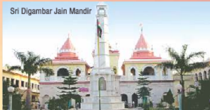
Sri Digambar Jain Mandir

Where to Stay: Tourists can stay at private hotels or Tourists Bungalows of Bihar State Tourism Development Corporation - Tathagal Vihar, Ajatshatru Vihar and Gautam Vihar.