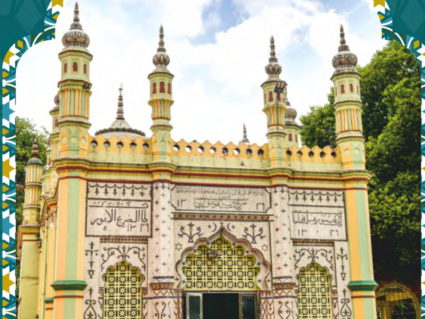
The Khanqah Mujeebia, Phulwari Sharif, Patna