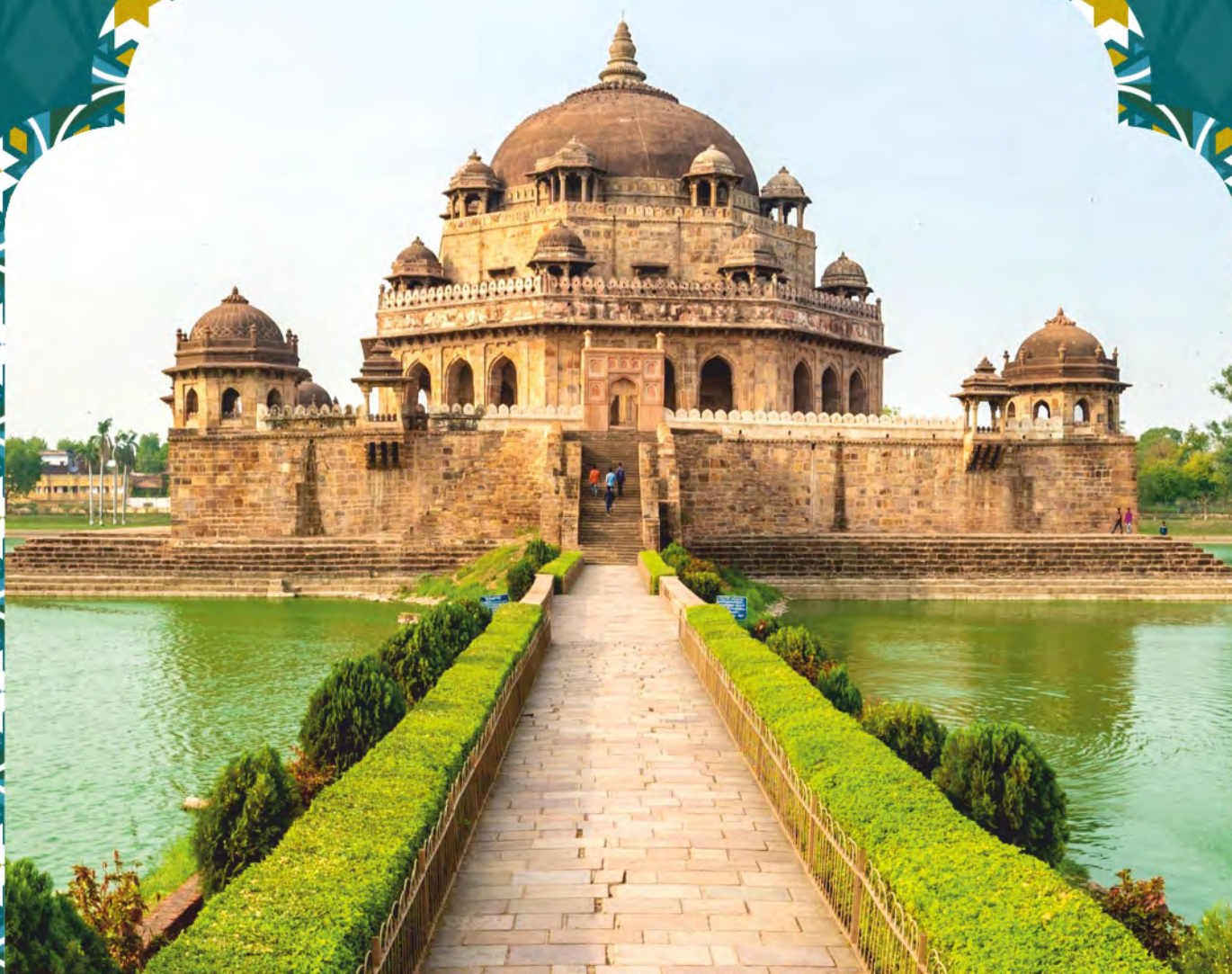
Sher Shah Suri's Mausoleum, Sasaram