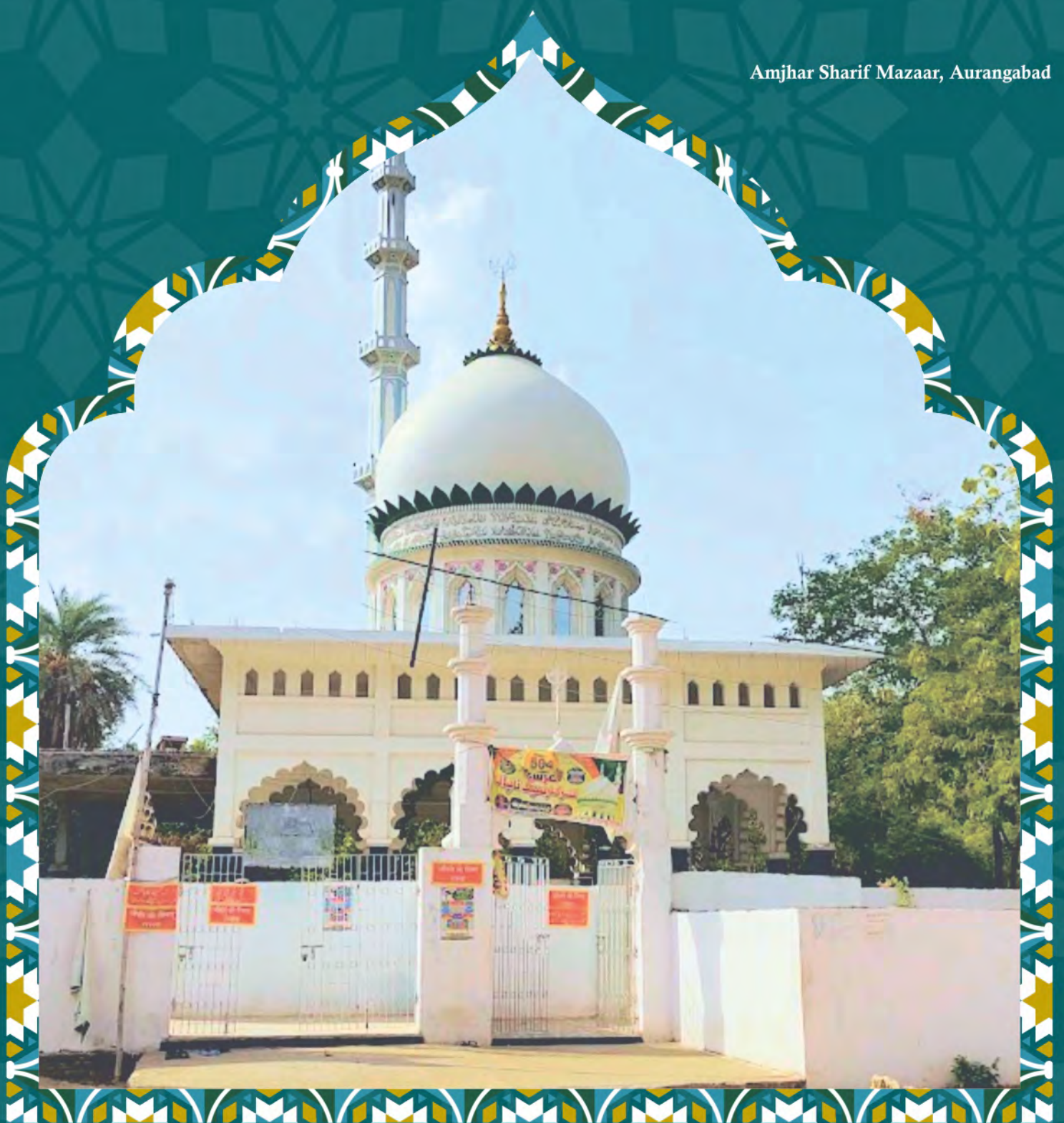
Amjhar Sharif Mazaar, Aurangabad